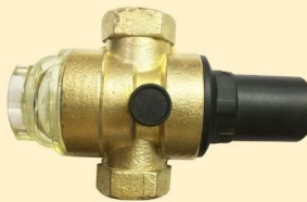
MODEL No. - PRV