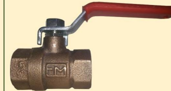
MODEL No. - GM