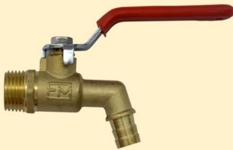
MODEL No. - NBC