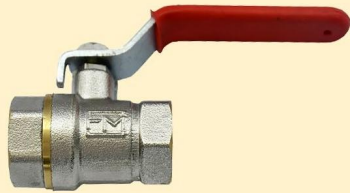
MODEL No. - BN