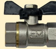
MODEL No. - BNB