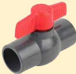
MODEL No. - UPVC