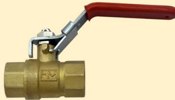
MODEL No. - BOL