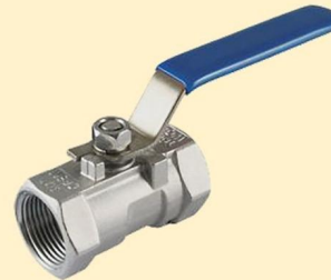
MODEL No. - SSB