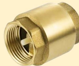
MODEL No. - NRV