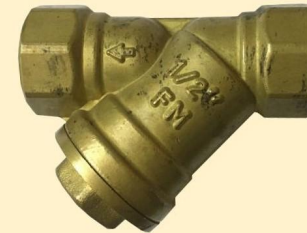
MODEL No. - ST