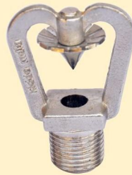
MODEL No. - SPN