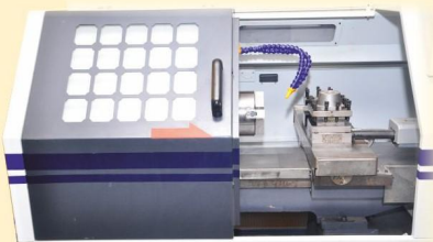
LM GUIDE OR HARDENED BED