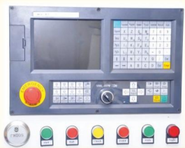
CONTROL SYSTEM HAOZE MAKE OR SIEMENS